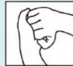
The back of the fingers